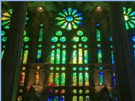
Ed: La Sagrada Familia, Barcelona