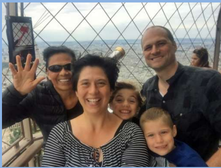
Rachel: The Eiffel Tower in Paris